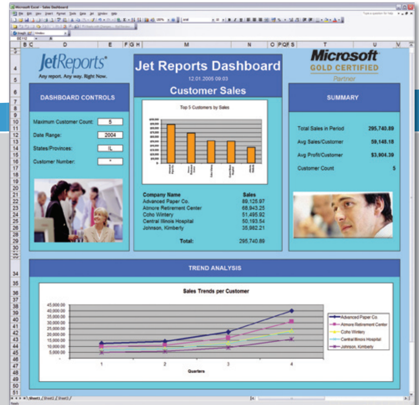
Customer Sales Dashboard

Sales dashboard showing customer sales statistics in a given time period.